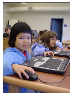
A Nesbit student works on one of the new laptops in the Community Learning Center.