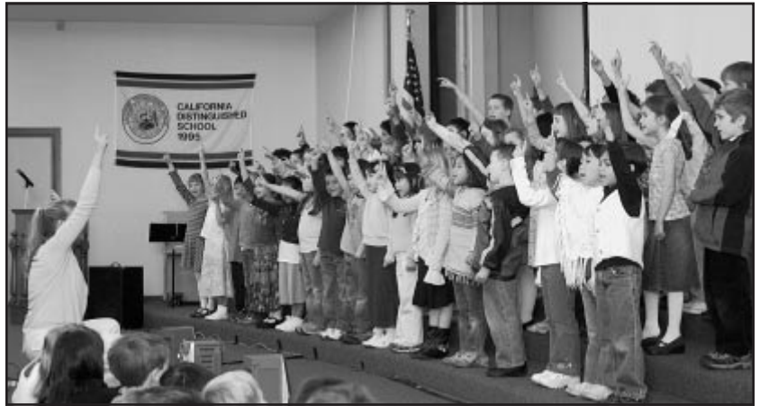
Central's Second Grade performs for the guests at Grandparent's Day on March 22nd.

Non-Profit Organization U.S. POSTAGE PAID Permit number 37 Belmont, CA.